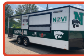
NATC Mobile Market