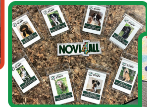
District Therapy Dogs