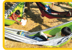
Novi Woods Hammock Garden

Since 1986 your donations to the Novi Educational Foundation have provided opportunities for our students that have enhanced their academic experience. You have also given teachers the resources they are longing for, but state level funding does not allow. Now more than ever teachers are relying on us to fill the gap. Your tax-deductible donation will continue to deliver creativity and innovation to our classrooms. Last school year, thanks to you, we awarded $66,196 in grants and scholarships to NCSd teachers and students.