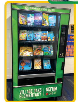
Village Oaks Book Vending Machine

Your gift affects not only the 6,700 NCSd students but also your neighbors and employees who live and work in the Novi community. Strengthening our schools directly impacts property values, attracts economic development, and reflects the pride we have in our community. Your contribution will be used to ensure excellent schools for years to come.