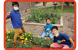
Elementary School Gardens