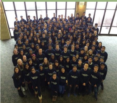
HOSA utilizing the resources the teacher grant bought

field is expanding every year, our HOSA grant has allowed students to participate and learn more about medical careers. With Link Crew, the NEF helped launch a program that provides yearlong support to our freshman class. Entering high school can seem daunting, but with the help of Link Crew leaders, freshmen attend an orientation session and always have upperclassmen they can rely on. This program has created interconnection among our student body and created a more harmonious high school.